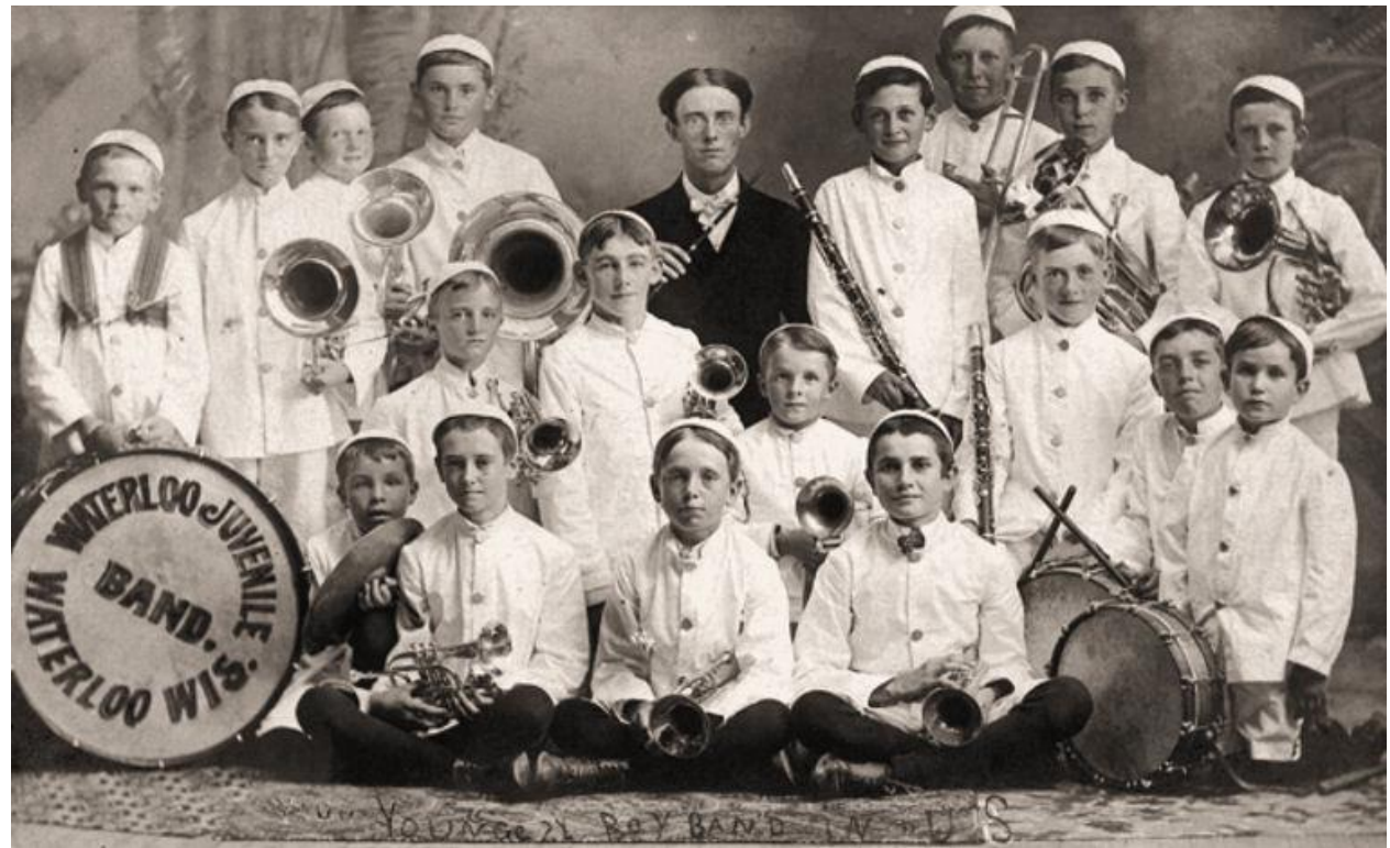
Waterloo, Wisconsin, Juvenile Band